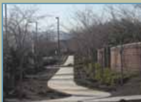
Arbor Park photo: Host to our community garden, Arbor Park features a centralized play structure surrounded by gardens and shaded seating that's ideal for an afternoon picnic.

One of the reasons many residents choose to live at Marley Park are the wonderful parks, front porches, and tree-lined streets that remind many of us of a small-town we once lived in or visited. One of the trees used throughout Marley Park is the Chinese Evergreen Elm ( Ulmus parviflora ). You'll find the Chinese Evergreen Elm along Sweetwater as well as lining the Arbor Walk. We tend to drive by daily and not notice much in the formative years, but there will come a day when streets like Sweetwater, Pershing and others will resemble a tree-lined street from established communities in the Midwest or in north Phoenix for that matter!