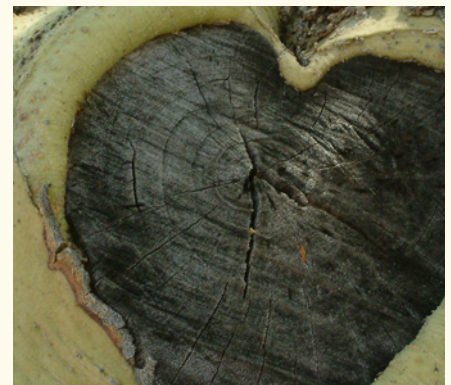
A proper cut will heal quickly and put as little strain on the tree as possible

For large trees or if you are in doubt, call a Certified Arborist. An Arborist can determine what type of pruning is needed and provide the service of a trained crew with the appropriate safety equipment and liability insurance. You can find a Certified Arborist at http://isa-arbor.com/findArborist/verifyArbByLoc.aspx .