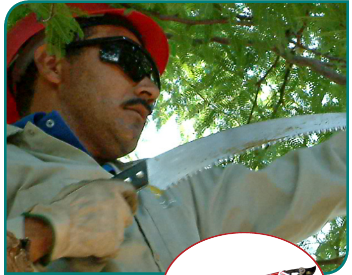
Above: Hand saw and safety equipment. Right: Bypass loppers

Lastly, DLC recommends that you never top trees. Topping is the indiscriminate cutting back of tree branches to stubs. This practice stresses and