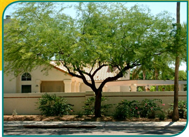
This Mesquite was pruned for stability; "crown thinning" reduces wind resistance and storm damage.