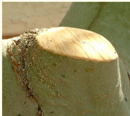
A fresh cut done properly with the right tools will promote the health of the tree