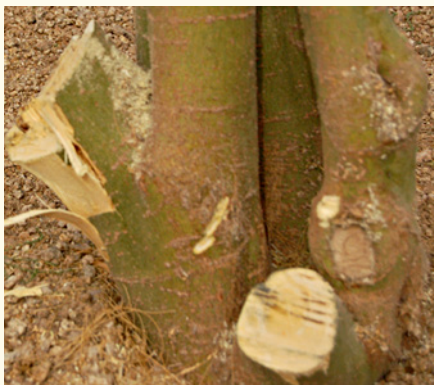
Bad cuts can severely damage trees and stunt their growth